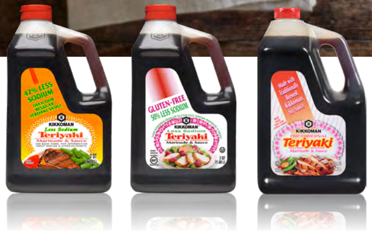
Two great alternatives for specific dietary needs: Less Sodium Teriyaki Marinade & Sauce and 50% Less Sodium Gluten-Free Teriyaki Marinade & Sauce