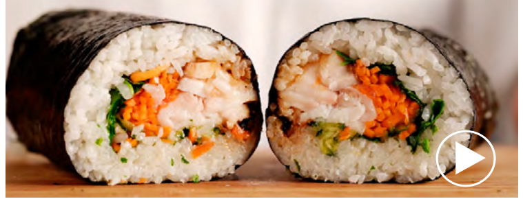
Black Cod Sushi Burrito