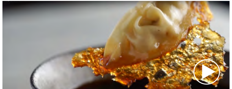
Winged Pot Stickers