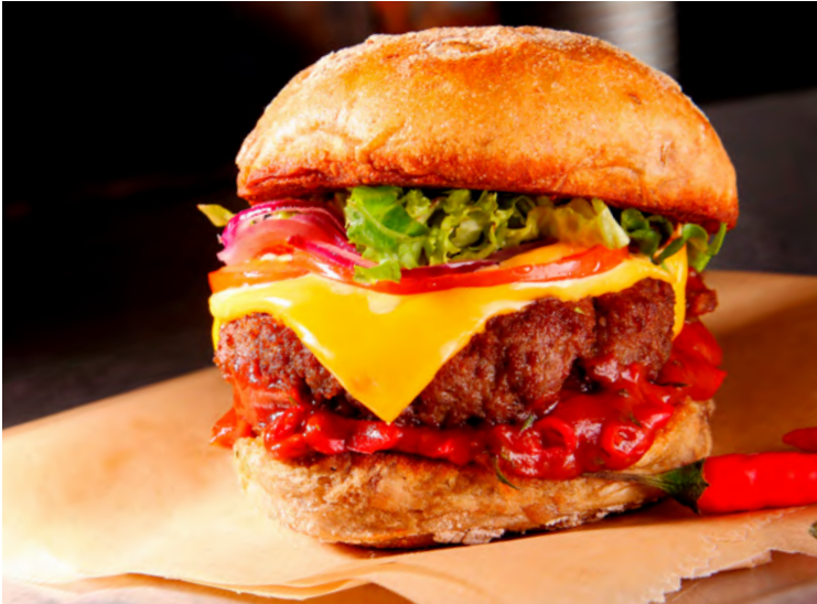
JUST ADD SRIRACHA

These days, takeout, delivery and grab-and-go are more important than ever. Here are some tips and strategies to enhance your to-go program.