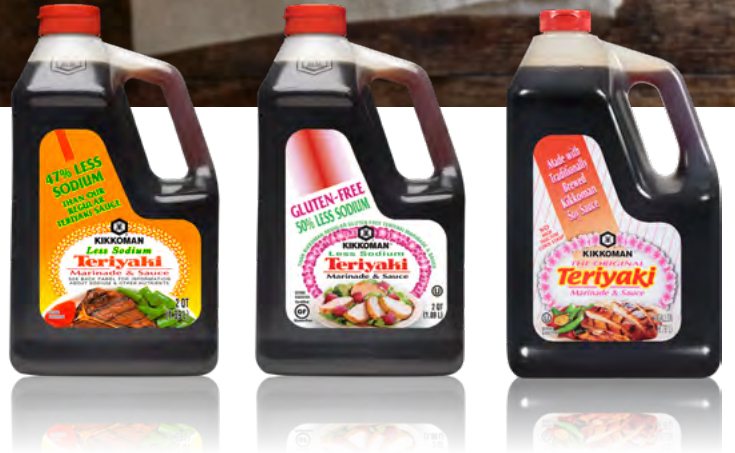
Two great alternatives for specific dietary needs: Less Sodium Teriyaki Marinade & Sauce and 50% Less Sodium Gluten-Free Teriyaki Marinade & Sauce