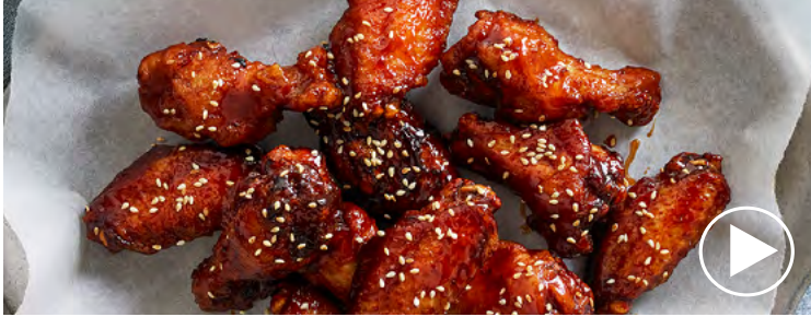
Honey-Sriracha Chicken Wings

Looking for a little menu “inspirAsian”? Check out these on-trend ideas that can all work well as grab-and-go and takeout offerings. Click here for our full library of foodservice videos.